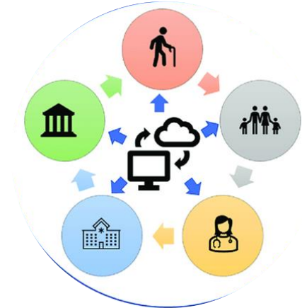
Disconnection between what we want and need