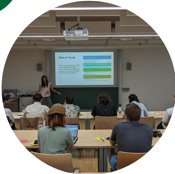
First Workshop EBSF 2023