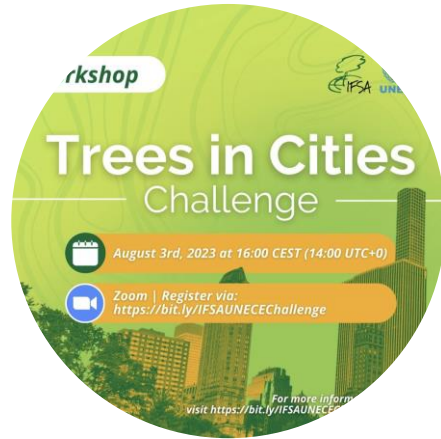
Collaboration with UNECE to promote "Trees in Cities Challenge" worldwide