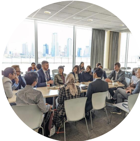
United Nations Forum on Forests