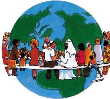
Global transformation or NO transformation