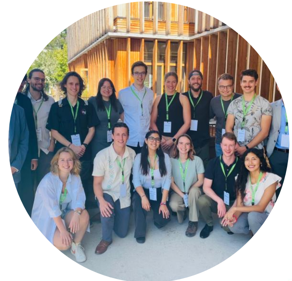
EBSF IFSA-IAAS-IACGB Youth Delegation