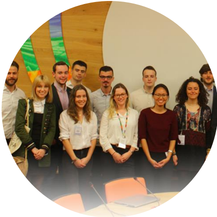
Meaningful inclusion of Youth in events