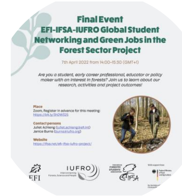
EFI-IFSA-IUFRO Research project on Green Jobs in the forest sector